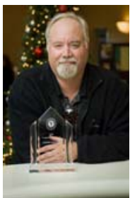
Bob Anchor Leadership Peer Award